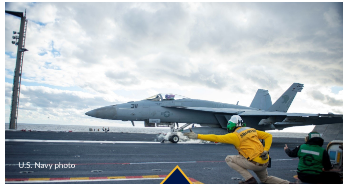
Creare's Sound Wave Protection Helmet, the HGU-99/P, underwent fleet assessment onboard the USS Eisenhower in December 2022.

Creare developed the Sound Wave Protection Helmet, designated the HGU-99/P. The HGU-99/P uses three layers of passive hearing protection to break through the limitations of legacy hearing protection systems. In addition to earplugs and specially designed ear cups, the HGU-99/P adds a noise-isolating helmet shell that also provides acute impact protection. Developed for aircraft squadron maintainers on carrier flight decks and for shipboard flight deck personnel, the HGU-99/P preserves auditory situational awareness and face-to-face communication for deck crew. An electronic “hear-through” technology recreates the ambient soundscape at the